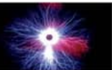
KIRLIAN PICTURE Negative Ions

The gemstones Tourmaline and Amethyst are known to emit negative ions. Negative ions are invisible, odorless molecules that we come into contact with in certain environments including evaporating water, ocean surf, and around waterfalls.