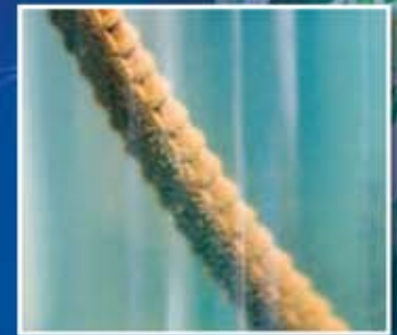
Detoxi Salt <ORP level: -420>

There is a large amount of residue and the degree of iron corrosion is very severe.