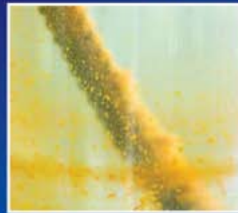
Sun-dried Sea Salt <ORP level: 116>

▶ Observation progress report after 7 months of testing